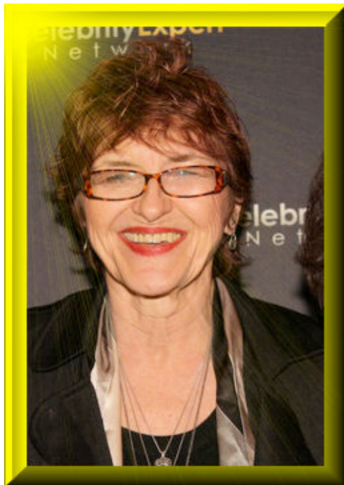
’SNOW BIG DEAL, I’ll Be Back! Says Healthy Foods Pioneer, Author & Wholistic Health Expert

Join this dynamic, internationally known chef, nutrition and natural foods marketing specialist, speaker, writer, and visionary (who has done just about everything you can do with food), as she explores the "as above, so below" connections between the worlds of food, nutrition and nourishment, including some surprising insights on the question, “Who Says Heaven Isn’t in Wine, Cheese and Chocolate?”