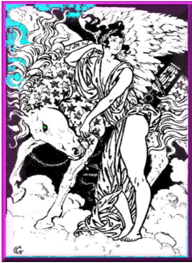
Eos, Goddess of Dawn; With Pegasus, her mount. Symbolizing Dawn of New Age Coming...