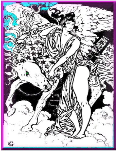
Eos, Goddess of Dawn; With Pegasus, her mount. Symbolizing Dawn of New Age Coming...