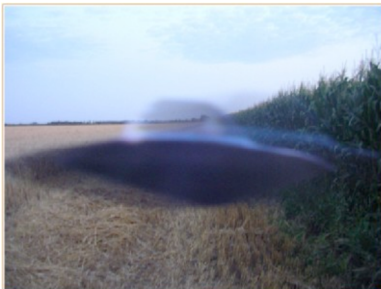
Photo taken August 4, 2009, of partially materialized UFO near Zavenbergen, Holland. Published on Filer's Files June 29, 2011. Note this Flying Saucer was caught in the act of partial "Materialization". Often described, rarely documented; this performance characteristic suggests "Interdimensionality"; which concept usually evokes ANGER! from "Engineer Types" who pontifically proclaim "Impossible" because they don't understand...