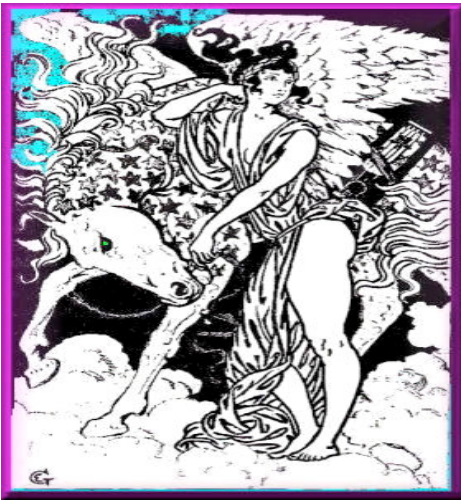
Eos, Goddess of Dawn; With Pegasus, her mount. Symbolizing Dawn of New Age Coming...